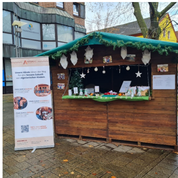
Our stand at the Christmas Market

As last year Adesuwa had a stand at the Oberhausen Christmas market. Many people stopped by, not only to buy special presents – homemade by 2 of our members - but also to learn about the work Adesuwa is doing.