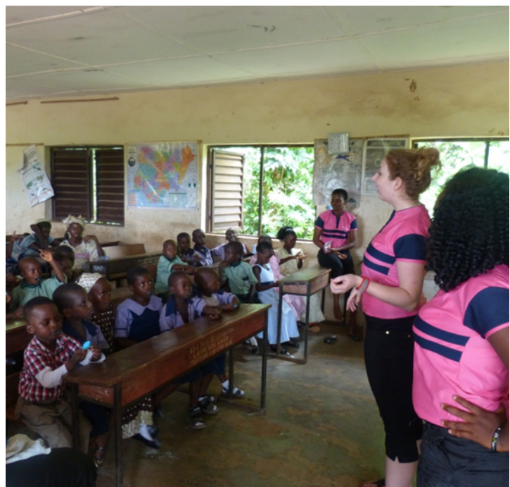
(left: One child is happy about the sweets he got which color the tongue blue – a present from a sponsor)