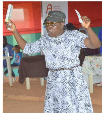
Doctor lectures on family planning