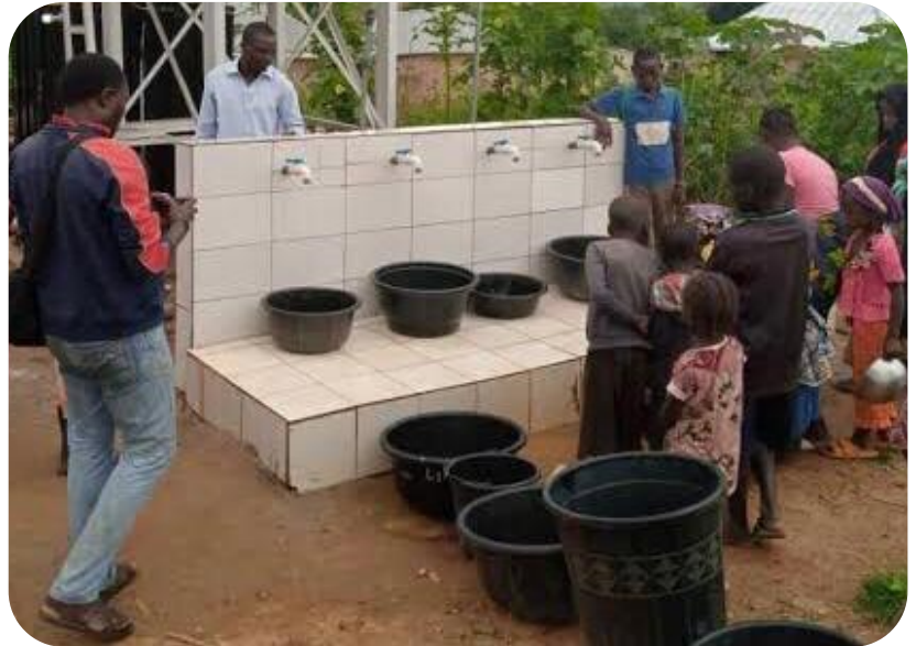
Example of borehole and water supply for Coker Village