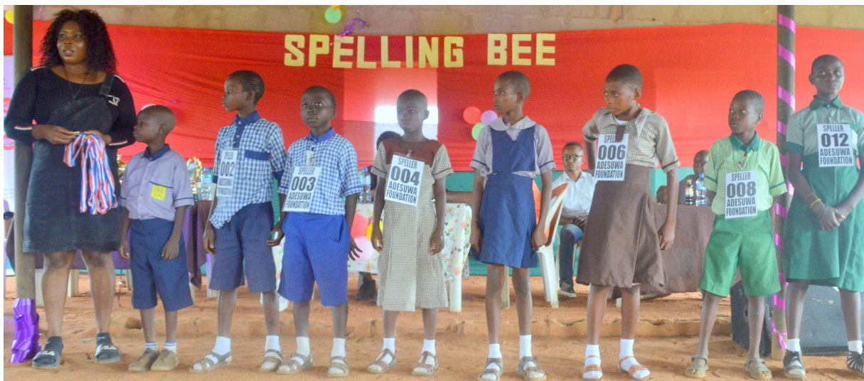
Winners of the Spelling Bee