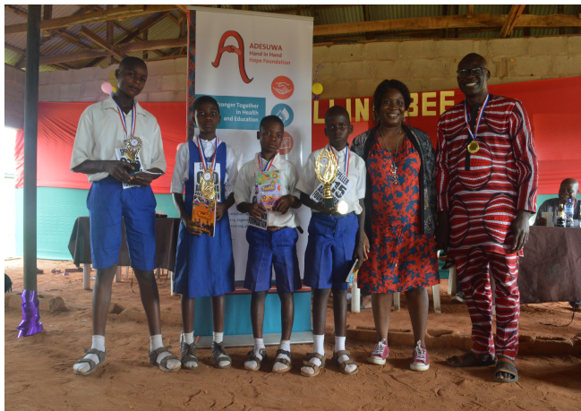
Junior winners with prizes