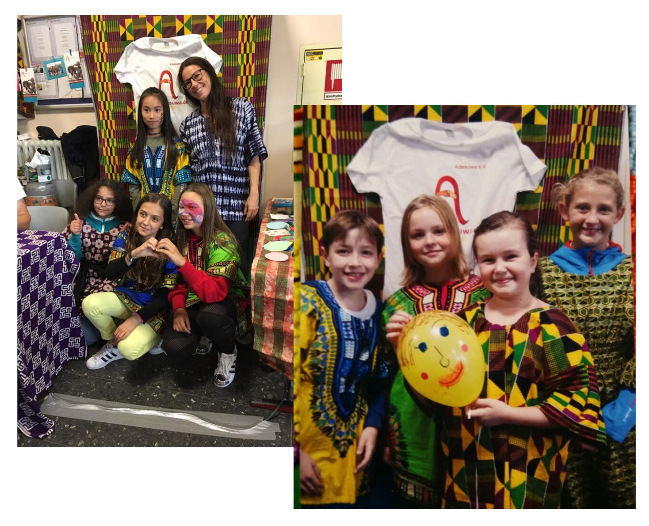
(Heinrich Heine pupils at the photo booth)