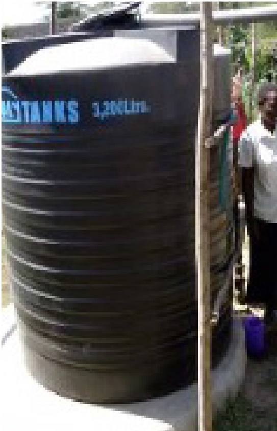
Water tank example

OUR COMMON GOAL: 10 BOREHOLES TO SUPPLY CLEAN WATER FOR ALL 20,000 INHABITANTS OF COKER VILLAGE! WE AIM TO START DRILLING IN 2022.