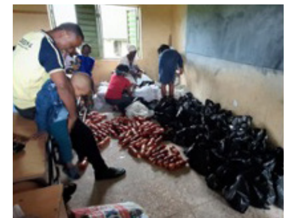
Food packages in COVID times