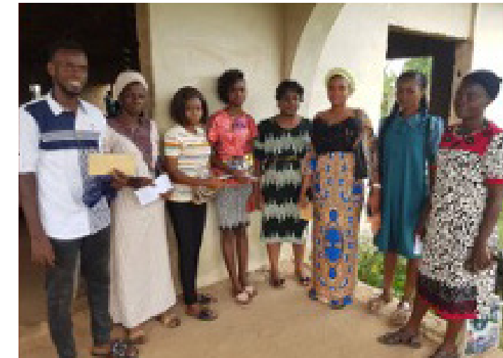
Our Tutors Even during the school closures due to the COVID outbreak, the tutors continued their efforts with a specially developed hygienic concept!

Now we have more children in secondary school than in primary school. In 2022 we will have our first group of Adesuwa secondary school graduates!